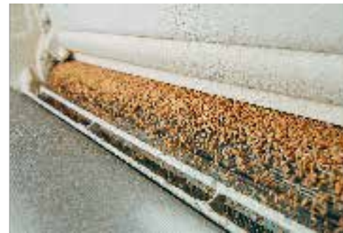
Agricultural Machinery Imports (million dollars)